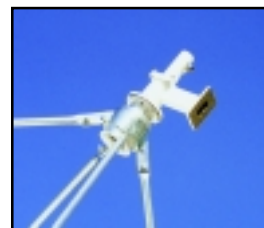
Options C-Band Linear Feed