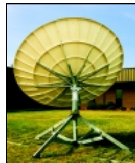
Back View Series 1374

Prodelin Corporation is the world's largest manufacturer of Rx/Tx VSAT antennas. We have the broadest product line in the industry including Receive Only, Rx/Tx and Rural Telephony antenna systems. Prodelin offers nineteen antenna sizes, 47cm to 4.5M. Prodelin is the leader in obtaining type certifications and approvals for Intelsat, AsiaSat and Eutelsat. Prodelin antennas provide the best quality in the market due to the sophisticated, precision SMC compression molding process technology. Prodelin provides the best value antenna solution to the market with competitive prices, the highest quality products and superb engineering support. Prodelin is ISO registered, KEMA # 70022.01. Prodelin - The Market Leader in VSAT Antennas.